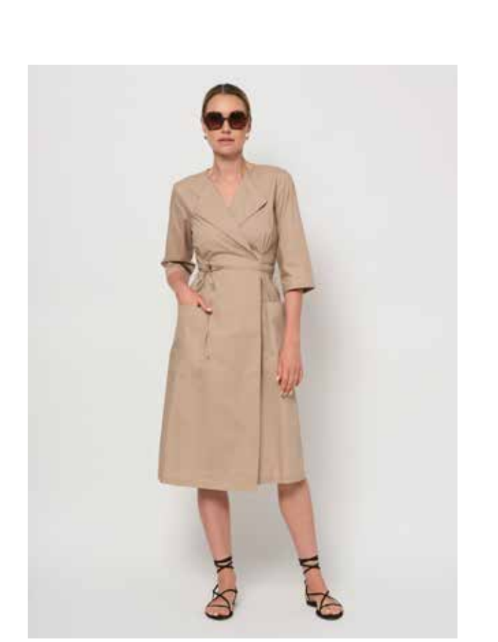
51.IV.05 Wrap dress: 100% cotton