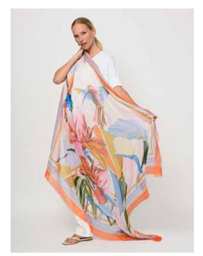
51.AH.14 Hummingbirds: 90% modal/10% silk,140 cm x 140 cm