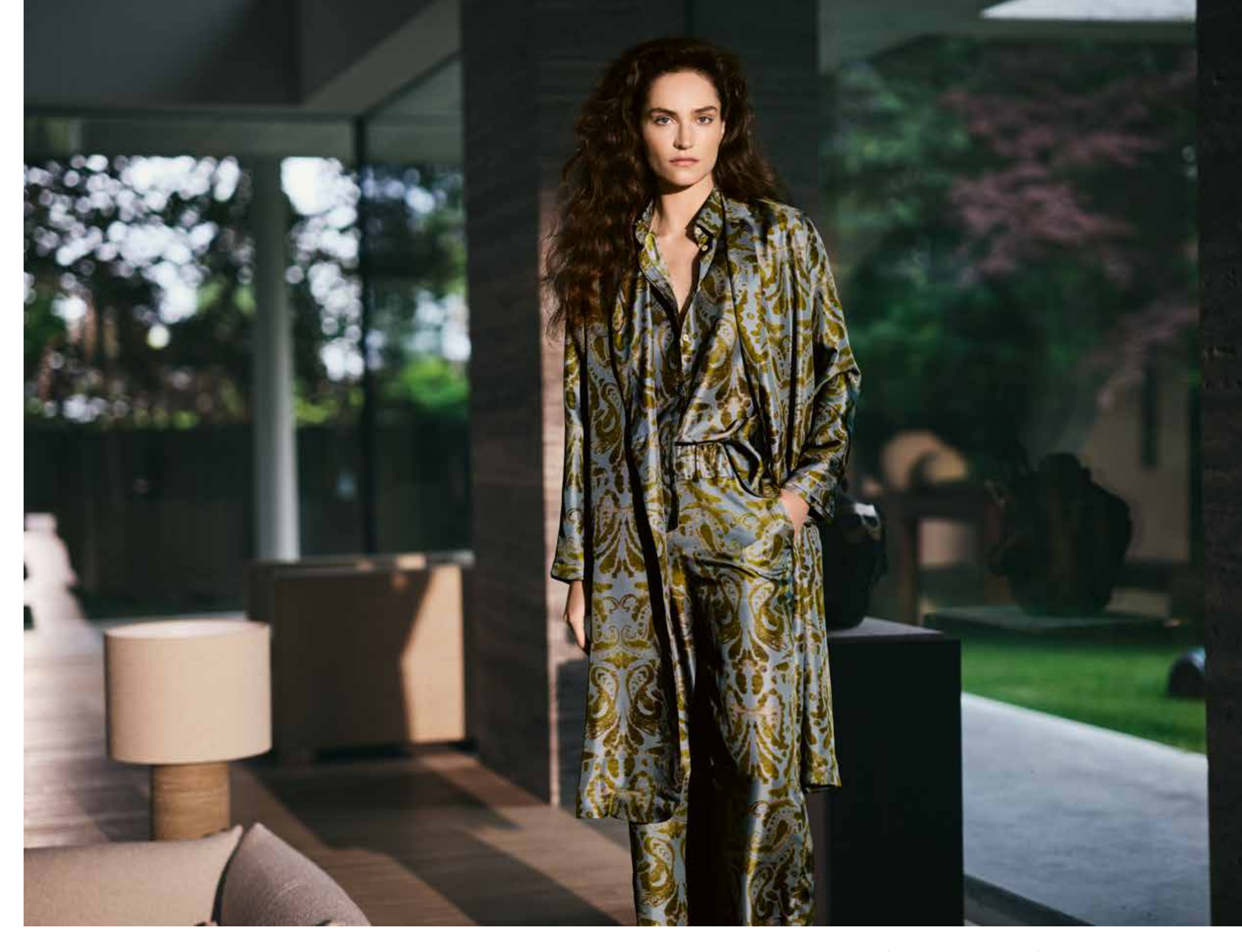
51.SI.06 Boxy shaped top: 100% silk | 51.SI.09 Wide trousers: 100% silk | 51.SI.10 Unstructured jacket: 100% silk