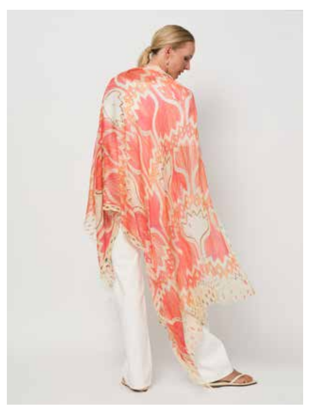
51.BS.02 Tulips: 100% cotton, 100 cm x 180 cm