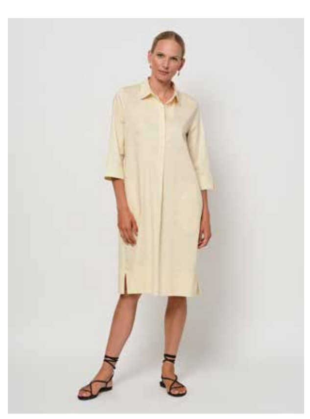
51.LC.03 Shirt dress: 65% cotton/30% polyamide/5% elastan