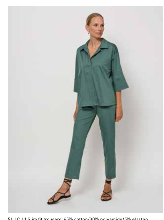
51.LC.11 Slim fit trousers: 65% cotton/30% polyamide/5% elastan 51.LC.14 Shirt with overlap detail: 65% cotton/30% polyamide/5% elastan