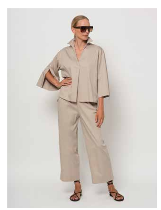
51.LC.05 Trousers: 65% cotton/30% polyamide/5% elastan 51.LC.13 Shirt with button down sleeves: 65% cotton/30% polyamide/ 5% elastan