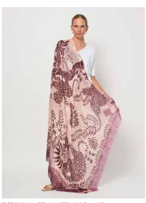
51.BS.31 Monkey: 80% modal/20% silk,140 cm x 140 cm