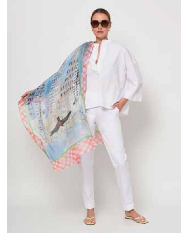
51.AH.09 City: 90% modal/10% silk, 100 cm x 180 cm