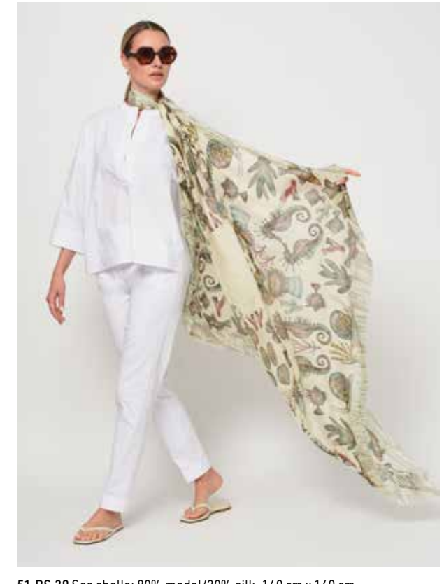
51.BS.39 Sea shells: 80% modal/20% silk, 140 cm x 140 cm