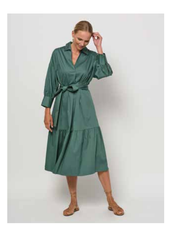
51.LC.01 Volant shirt dress: 65% cotton/30% polyamide/5% elastan