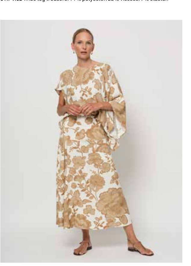
51.PC.04 Asymmetric top: 100% viscose 51.PC.08 Swing skirt: 100% viscose