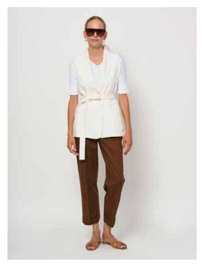
51.IV.11 Cropped trousers: 100% cotton | 51.MA.05 V-neck sweater: 65% viscose/35% polyamide | 51.SU.03 Waistcoat: 100% cotton