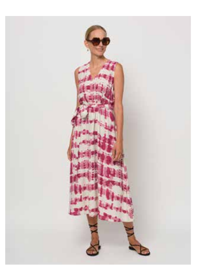
51.PC.07 V-neck belted dress: 100% viscose