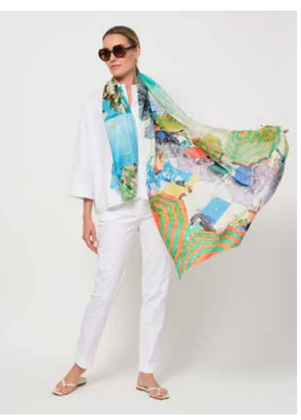
51.BS.22 Beach: 80% modal/20% silk, 100 cm x 180 cm