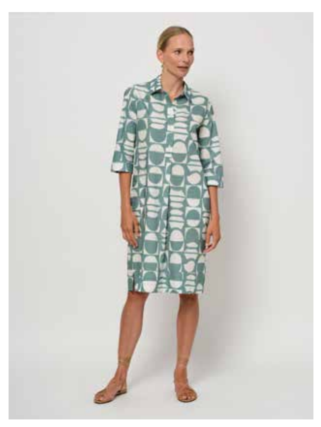
51.LP.03 Shirt dress: 100% cotton