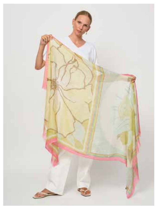
51.BS.06 Flower: 100% cotton, 100 cm x 180 cm