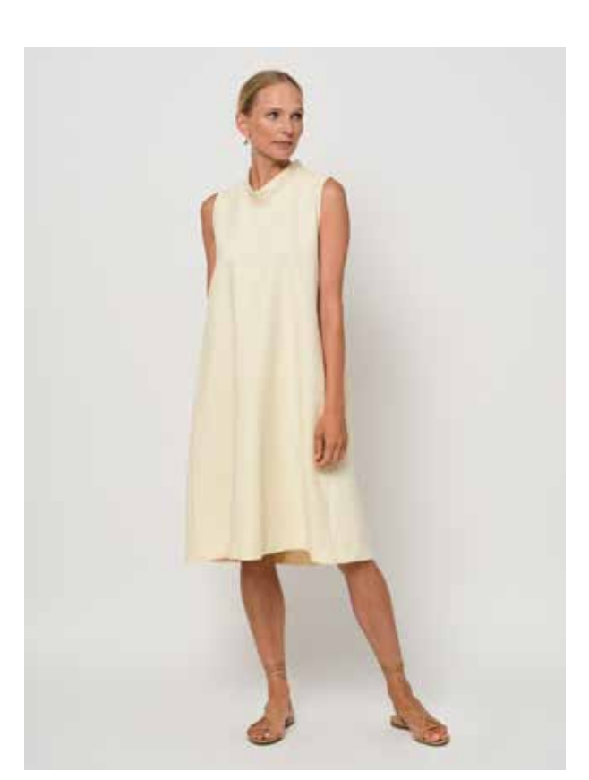
51.PV.05 A-line dress: 71% polyester/22% viscose/7% elastan