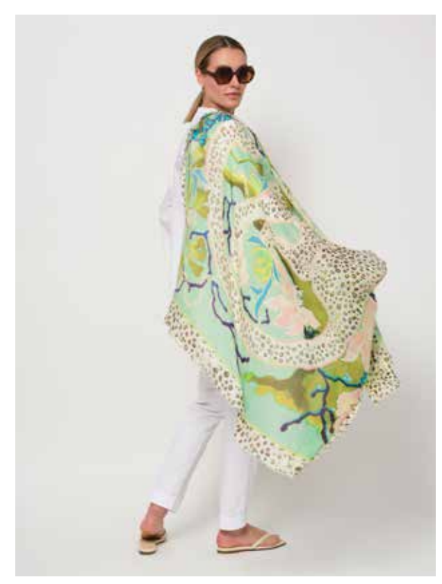
51.BS.41 Eden: 80% modal/20% silk, 140 cm x 140 cm