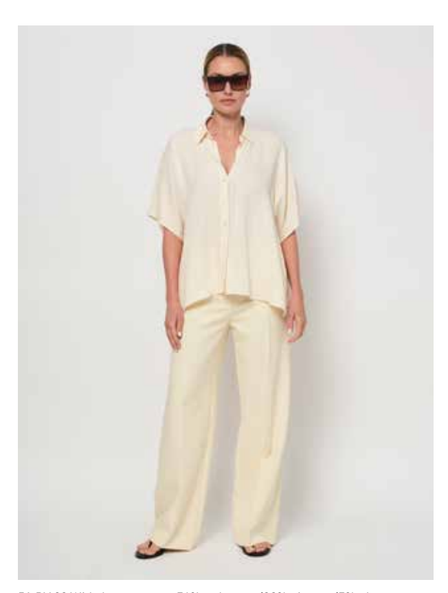
51.PV.02 Wide leg trousers: 71% polyester/22% viscose/7% elastan 51.VC.04 A-line shirt: 100% viscose