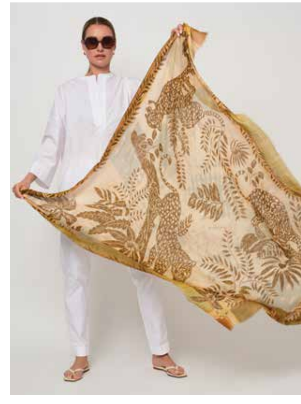
51.BS.32 Wild jungle: 80% modal/20% silk, 140 cm x 140 cm