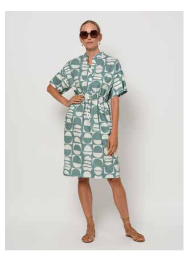
51.LP.08 Shirt dress: 100% cotton