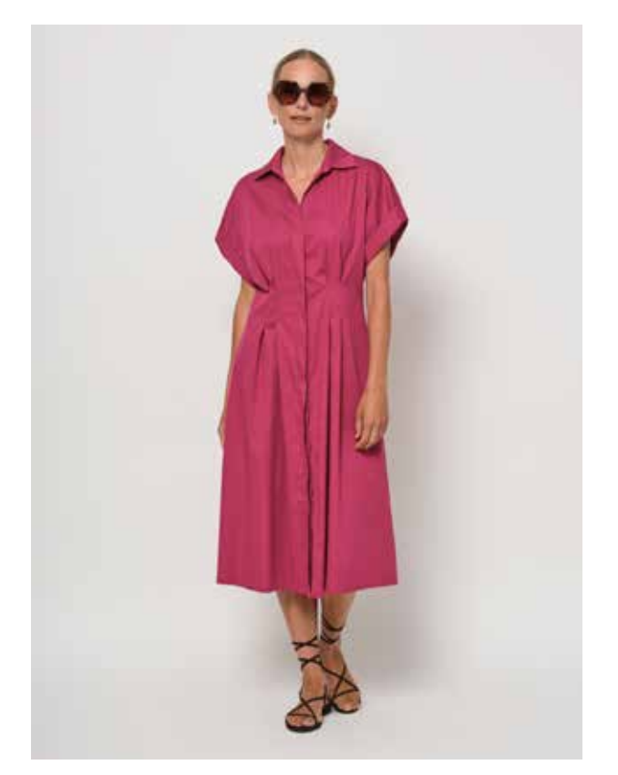
51.LC.04 Shirt dress: 65% cotton/30% polyamide/5% elastan