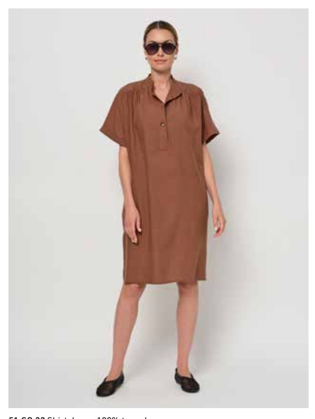
51.SC.33 Shirt dress: 100% tencel