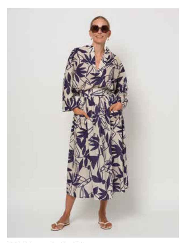
51.SC.22 Cotton voile skirt: 100% cotton 51.SC.24 Voile blouse: 100% cotton