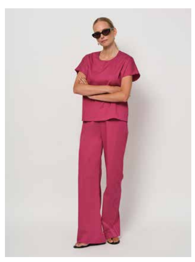
51.LC.06 Trousers: 65% cotton/30% polyamide/5% elastan 51.LC.12 Crew neck top: 65% cotton/30% polyamide/5% elastan