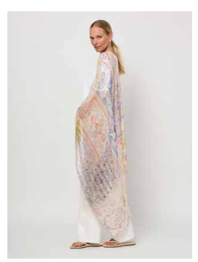
51.AH.05 Carpets: 90% modal/10% silk, 100 cm x 180 cm