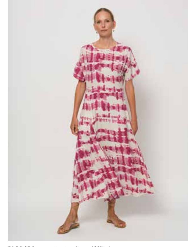
51.PC.05 Crew neck swing dress: 100% viscose