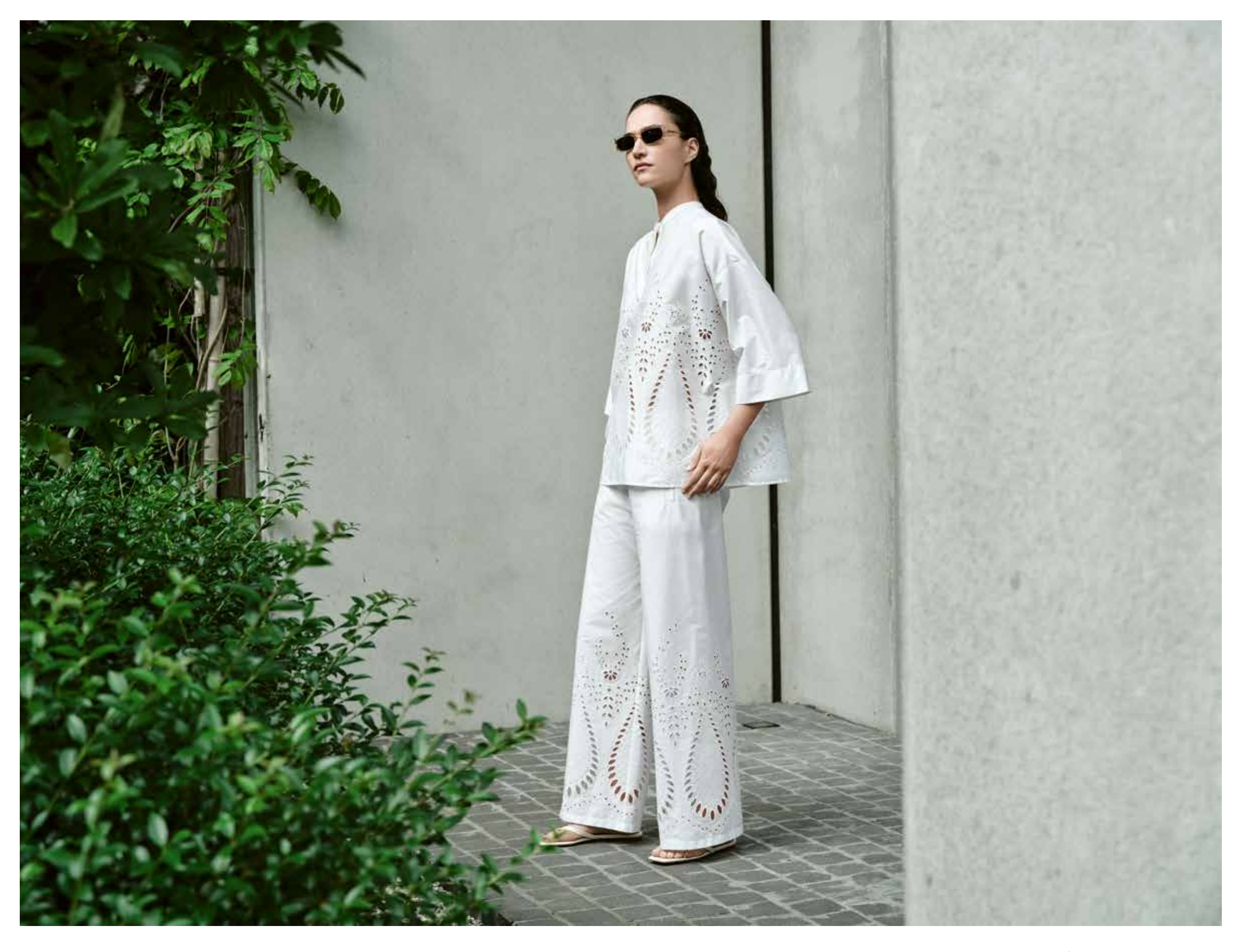
51.SC.01 Ajour blouse: 100% cotton | 51.SC.02 Ajour pants: 100% cotton