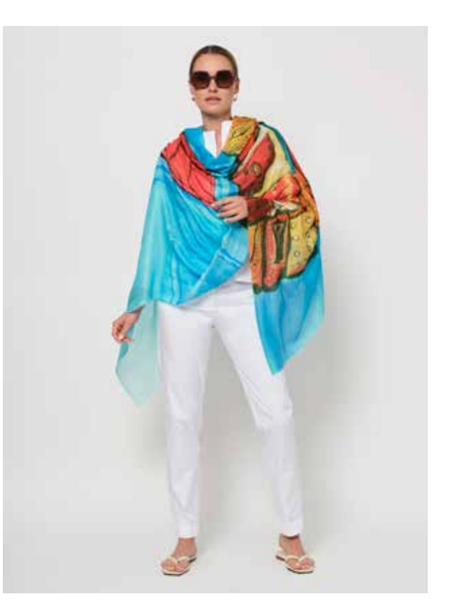
51.BS.20 Doors: 80% modal/20% silk, 100 cm x 180 cm