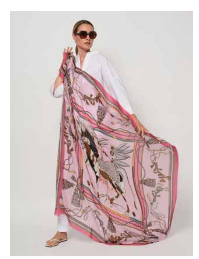
51.BS.33 Horse: 80% modal/20% silk, 140 cm x 140 cm