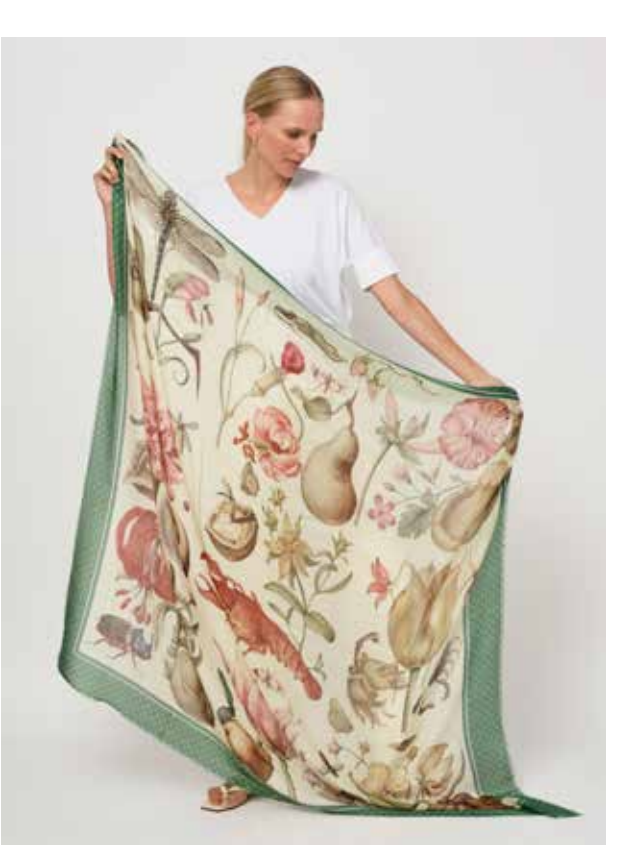
51.BS.35 Crab: 80% modal/20% silk, 140 cm x 140 cm