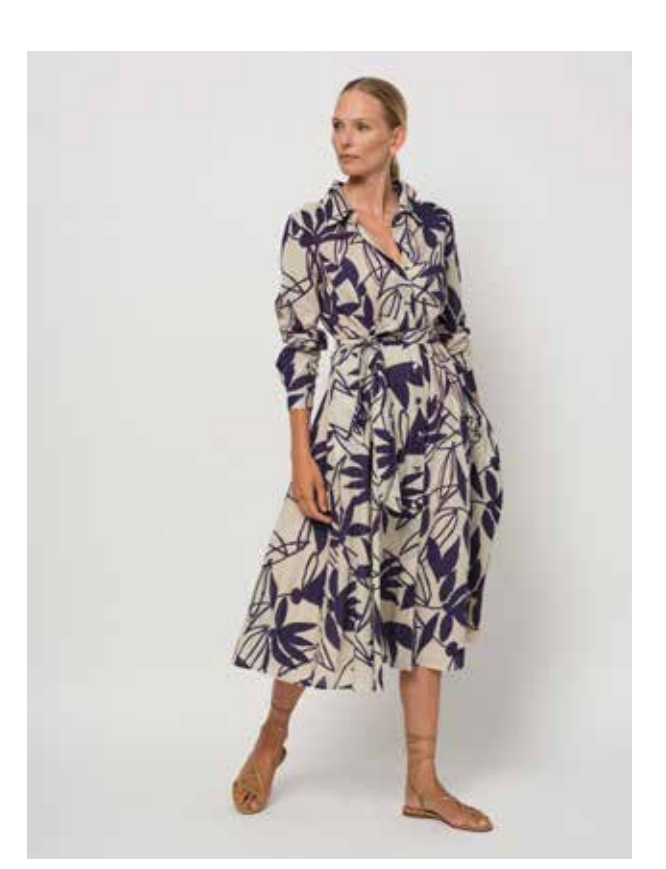
51.SC.21 Button down shirt dress: 100% cotton voile