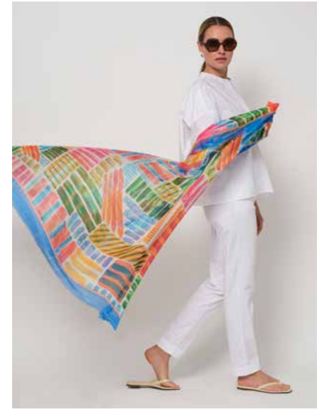
51.AH.18 Grid: 90% modal/10% silk, 140 cm x 140 cm