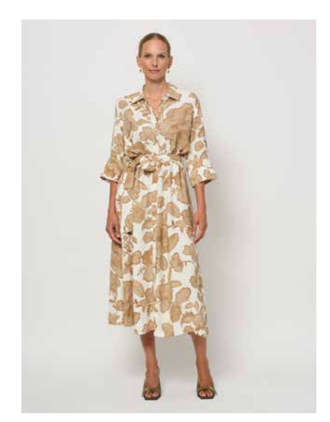
PC01 Shirt dress: 100% viscose