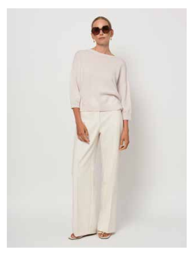
51.PM.02 Crew neck sweater: 100% cashmere 51.PV.02 Wide leg trousers: 71% polyester/22% viscose/7% elastan