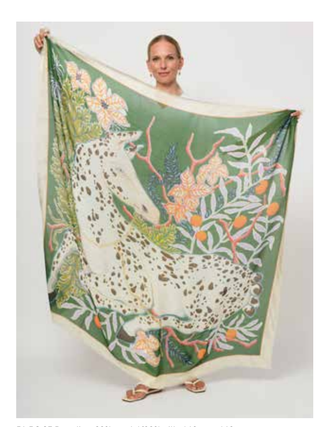
51.BS.37 Paradise: 80% modal/20% silk, 140 cm x 140 cm