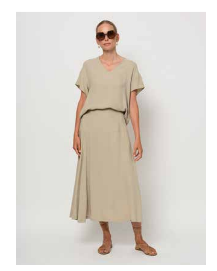
51.VC.02 V-neck blouse: 100% viscose 51.VC.05 Panel insert skirt: 100% viscose