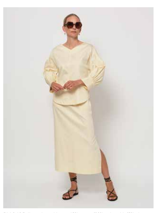
51.LC.10 Balloon sleeve blouse: 65% cotton/30% polyamide/5% elastan 51.LC.15 Pencil skirt: 65% cotton/30% polyamide/5% elastan