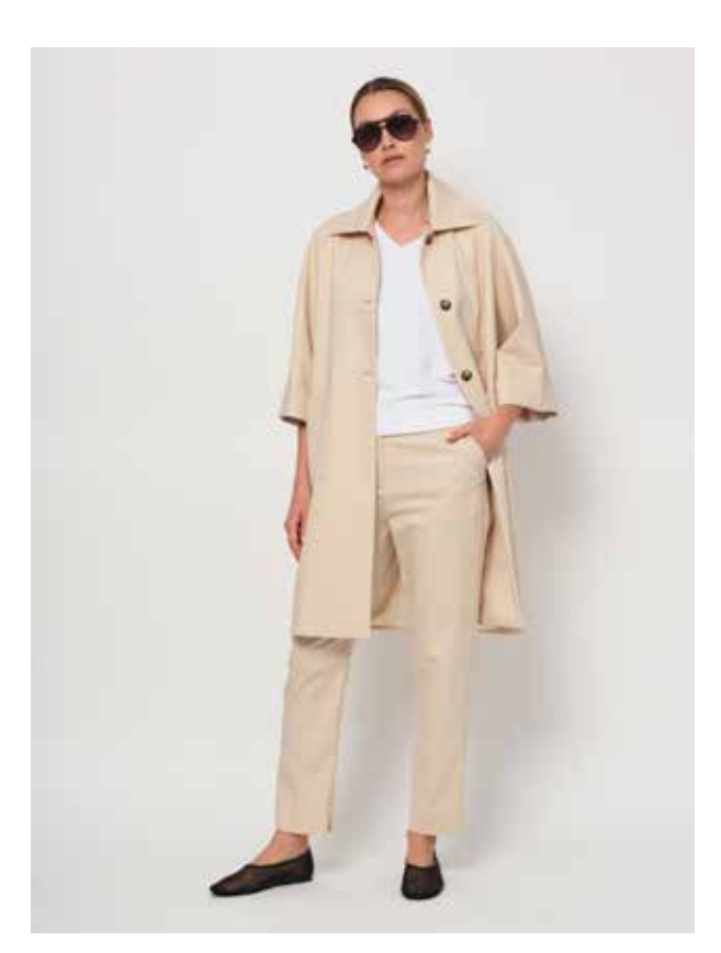
51.SC.14 Jacket: 75% cotton/22% polyamide/3% elastan 51.SC.16 Slim pants: 75% cotton/22% polyamide/3% elastan 51.MA.05 V-neck sweater: 65% viscose/35% polyamide

51.IV.10 Slim trousers: 98% cotton/2% elastan